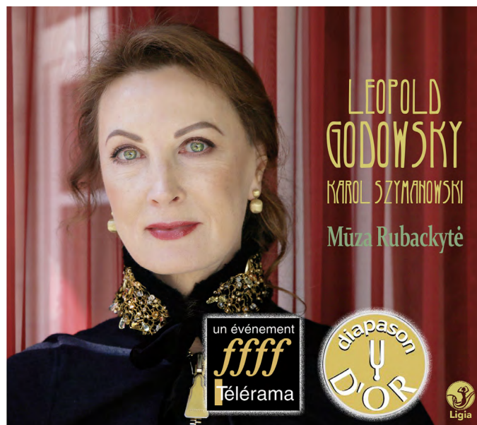
Label Ligia / Distribution Socadisc

Karol Szymanowski occupies a prominent place in his generation of Polish composers. Of his early compositions, written at the dawn of the 20th century, most of which he destroyed, these 9 Preludes opus 1, dating from 1899-1900 and published in 1906, remain. The legacy of Chopin can be seen here, combined with the harmonic metamorphoses of Tristan and the contemporary influence of Scriabin through the superimposition of binary and ternary rhythms.